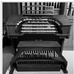
Allen TH-3 theater

Sales, service, installation, financing and leasing are available on all products.