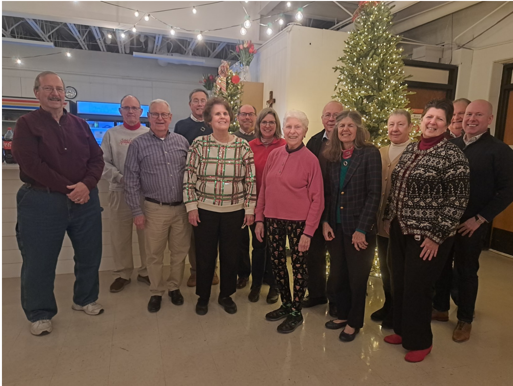
Attendees at the 2026 Chapter Epiphany Party