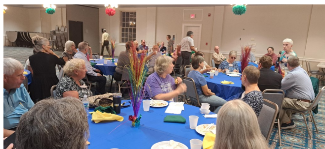
Chapter dinner enjoyed by 30+ members on Monday, September 16, 2024 at Ladue Chapel Presbyterian Church