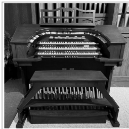
Allen TH-3 theater

Sales, service, installation, financing and leasing are available on all products.