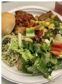
A delicious $20 meal.