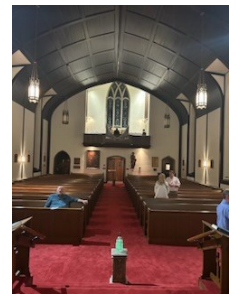
Nave of St. Paul's Church.

Proud sponsor of the American Guild of Organists