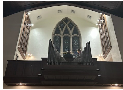
Organ loft of St. Paul's Episcopal Church.