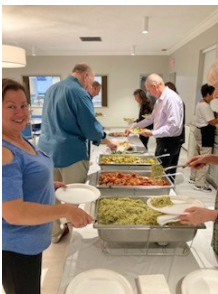
Serving up a great dinner.