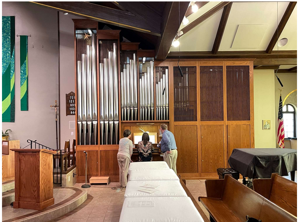
The works at St. Monica's