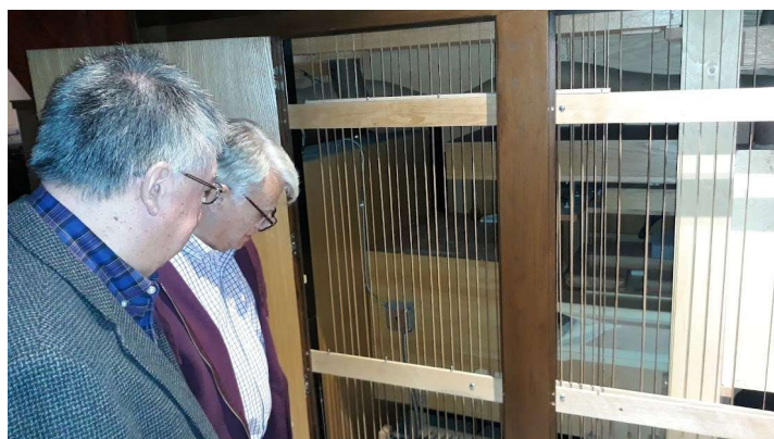
The back of the tracker at Peace