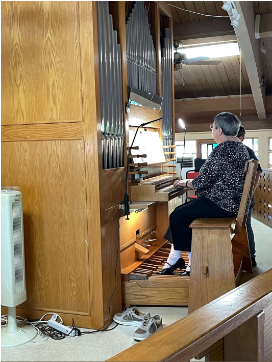
The bench at Reformation