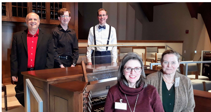
Saint Louis Chapter members who played for a Member Lenten Recital