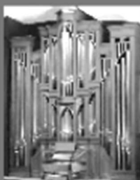
Casavant Pipe Organ