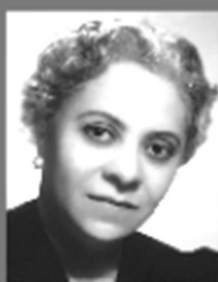
Florence Price Composer

Principia Dance program in Seven Last Words and Triumph of Christ Black women composers of Exodus Suite (Tribute to Harriet Tubman) , Sonata in D