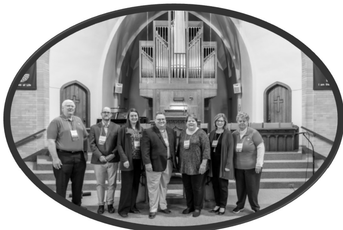
February Flourish Clinicians

See more on our website