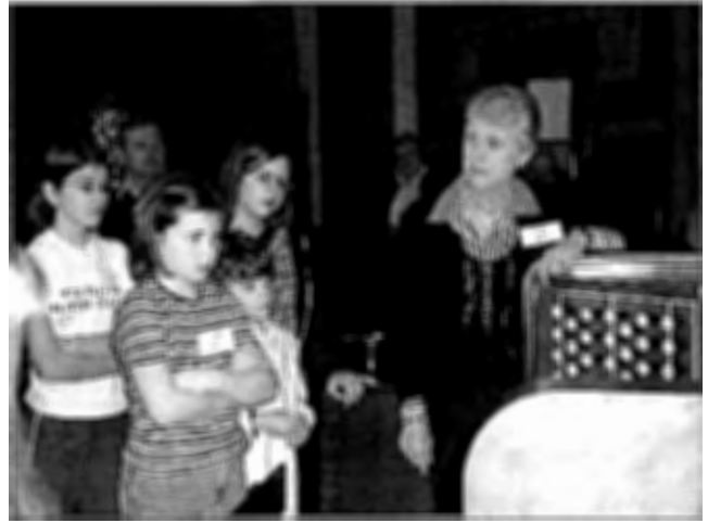
Cathy Bolduan answers questions from the curious