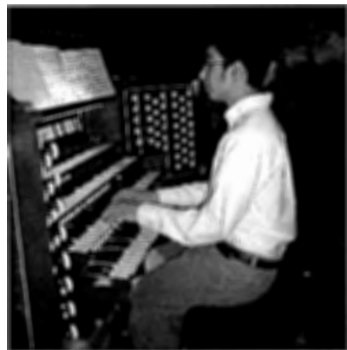
All who wanted a turn at the organ could play a piece