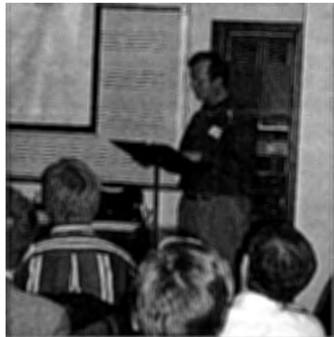
Those in attendance listen to the sounds of the organ