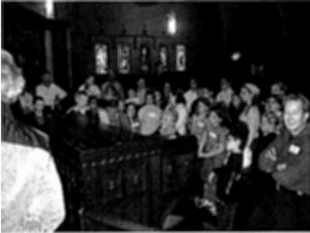
Those in attendance listen to the sounds of the organ