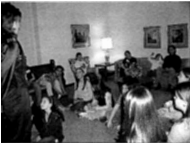
Watching a video about young organists and organs