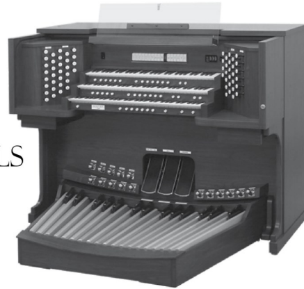
NEW ORGANS AND RENTALS