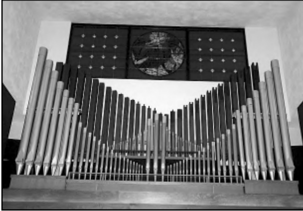
Pipes of the Allen/Moller organ at St. Elizabeth's Catholic Church, Granite City.