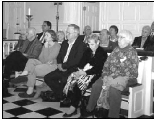
A rapt "choir" audience...