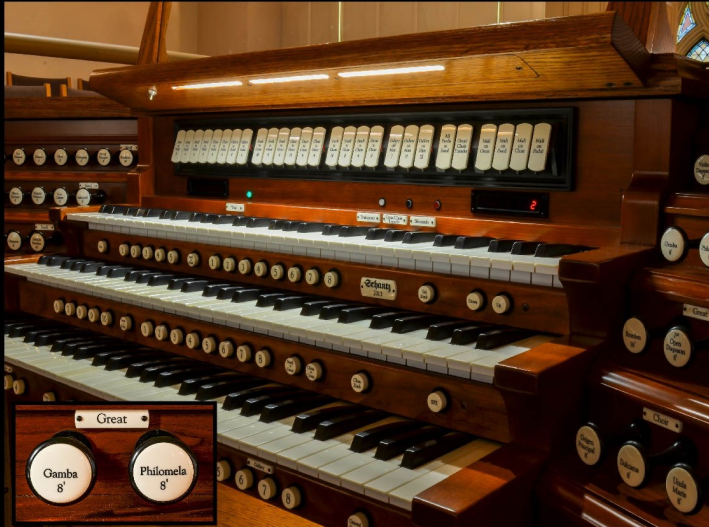
HISTORIC TRINITY LUTHERAN CHURCH ~ Saint Louis, Missouri