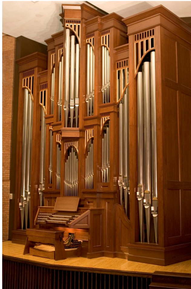
Casavant Op. 3838 2005 3/55