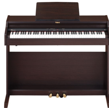
St. Louis' area only authorized dealer for Roland digital pianos, professional keyboards, keyboard labs, digital harpsichords and celestas.