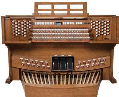
Rodgers digital classical organs, digital pipe organ combinations, practice and studio consoles.