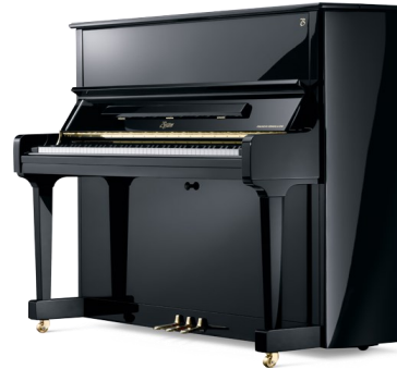
Steinway, and Steinway-designed Boston and Essex classroom and practice pianos.