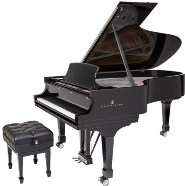
Steinway & Sons and Steinway-designed Boston concert and recital grand pianos.

Our free inventory analysis can assist with instrument allocation, replacement schedules, budgeting, and fundraising. This bound document is essential in the case of damage by fire or lightning.