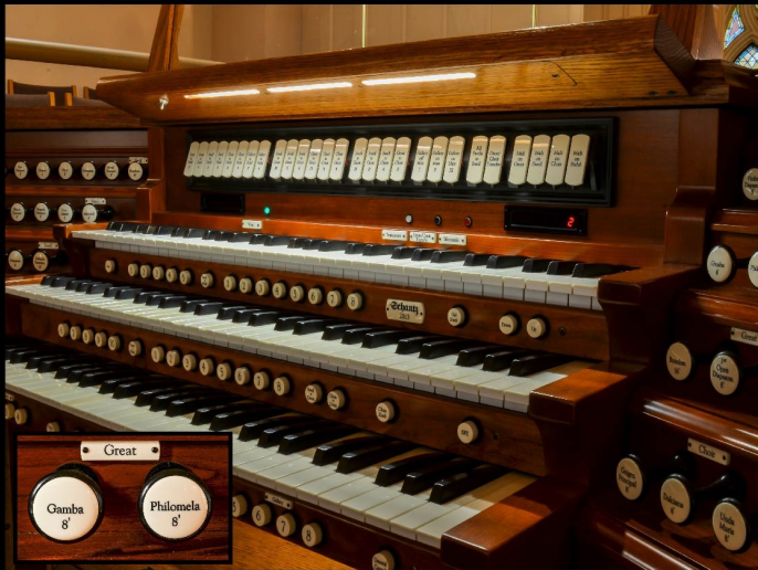
HISTORIC TRINITY LUTHERAN CHURCH ~ Saint Louis, Missouri