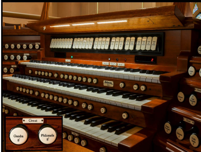
HISTORIC TRINITY LUTHERAN CHURCH ~ Saint Louis, Missouri

SCHANTZ ORGAN COMPANY A LEGACY BUILT ON PROMISES KEPT