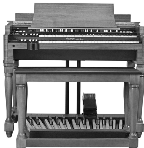
"The Legend" Featured at the Urban Doxology session