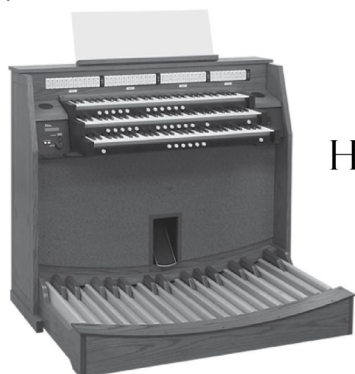
HOME PRACTICE INSTRUMENTS