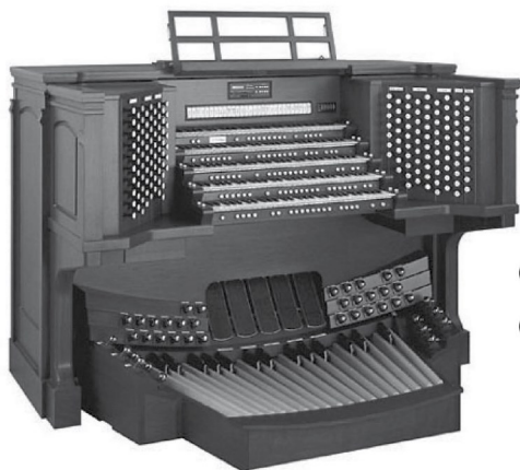
CUSTOM CONSOLES AND COMBINATION INSTRUMENTS