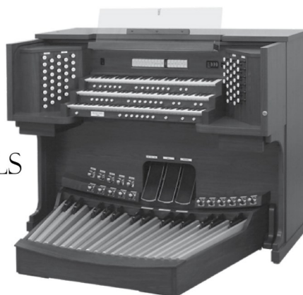
NEW ORGANS AND RENTALS