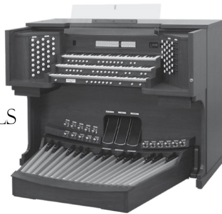
NEW ORGANS AND RENTALS