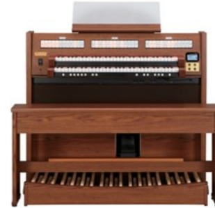
Roland Classic Series

You aspire to be the best church organists. Do you have to choose between technical proficiency or musical artistry? No! You aim for both .