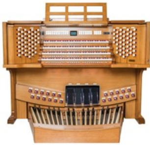
RODGERS Infinity SERIES™